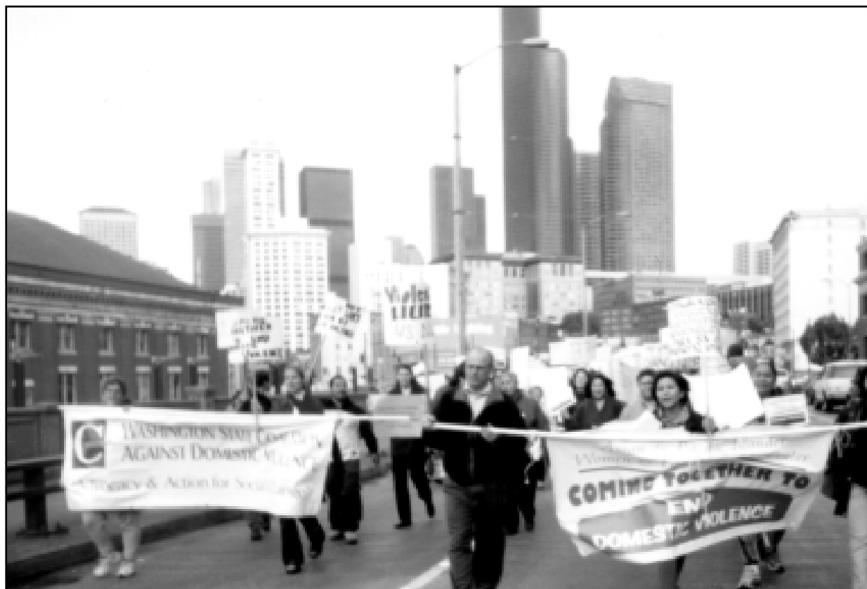
Coming Together To End Domestic Violence

vided a means for discussing domestic violence within a cultural context. These workshops allowed men and elders to discuss the topic in a nonjudgmental environment and created an opportunity for a few community leaders to publicly disclose their own experiences in surviving domestic violence and abuse.