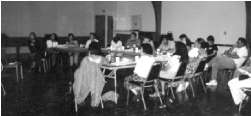
Trained Bilingual and Bicultural Outreach Volunteers

The volunteers are people who are "natural helpers" in the community. They may be hair stylists, café owners, day care providers, bartenders, teachers—they are the ones other people talk