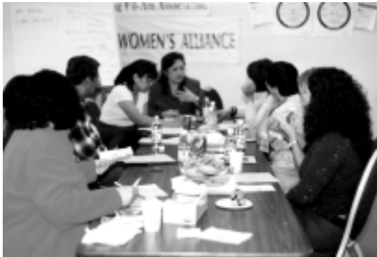
Although domestic violence is the main topic of discussion, other topics include dilemmas of newly arrived immigrants.