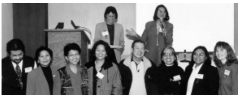
Filipino Education Committee Founders

Collectively, the Safety Center and the Filipino Education Committee on Domestic Violence began efforts to educate each other about domestic violence, from forums with expert panelists and survivors to meetings of grassroots organizers.