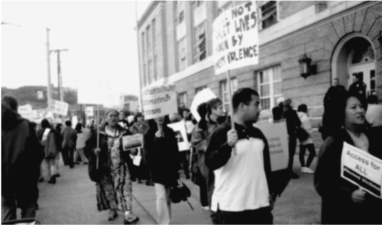
Rally in Front of INS Building