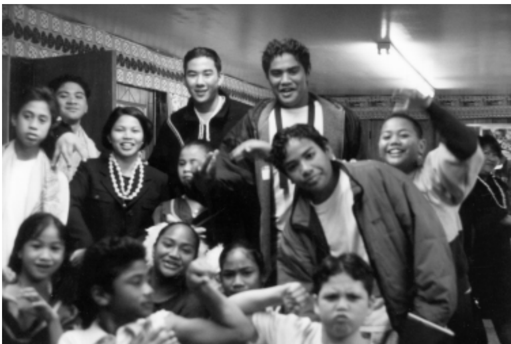
Youth and Facilitators Celebrate after Graduation Ceremonies for the Samoan Anti-Violence Parenting Class

more likely to attend an evening class if they are relieved of some of the family chores at home. It